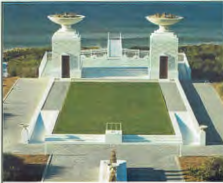
KHOURY & VOGT ARCHITECTS