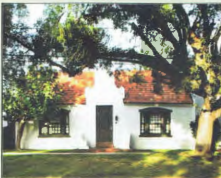
CURE & PENABAD ARCHITECTS