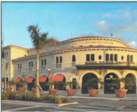
DAVID M. SCHWARZ ARCHITECTS HOYT ARCHITECTS