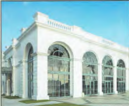
SMITH ARCHITECTURAL GROUP