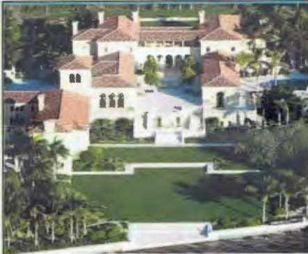
FAIRFAX & SAMMONS ARCHITECTS