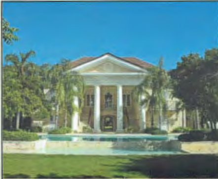
ERNESTO BUCH ARCHITECT, INC.