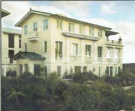
ROBERT A. M. STERN ARCHITECTS