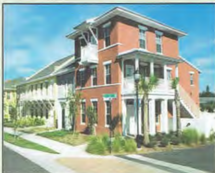
COOPER JOHNSON SMITH ARCHITECTS & TOWN PLANNERS